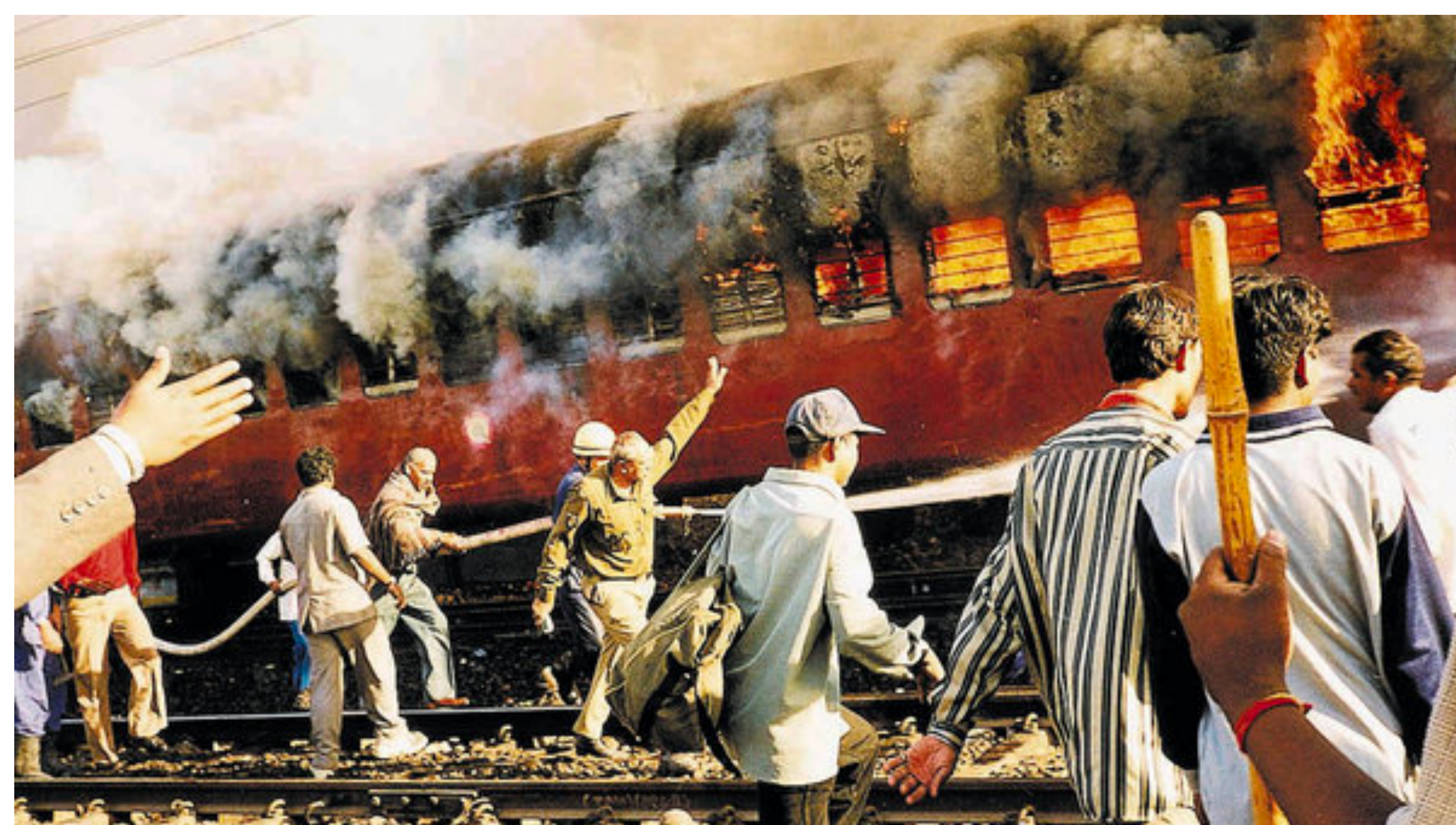
Train fire kills Hindu Pilgrims, Feb. 27, 2002